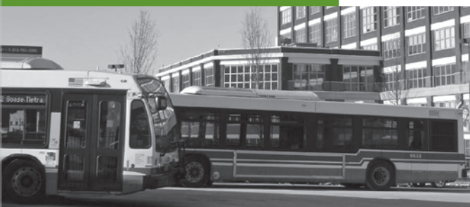
The new CTA Route #132, The Goose Island Express, connects corridor employees with major train lines.