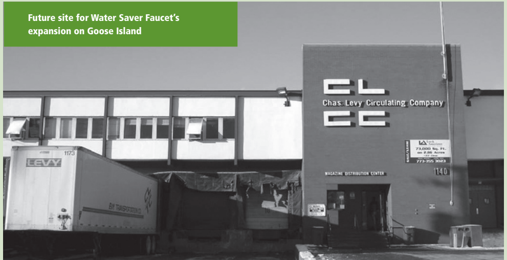
Future site for Water Saver Faucet's expansion on Goose Island

Water Saver quickly assessed the Chas Levy site and submitted a winning bid at auction for the property.