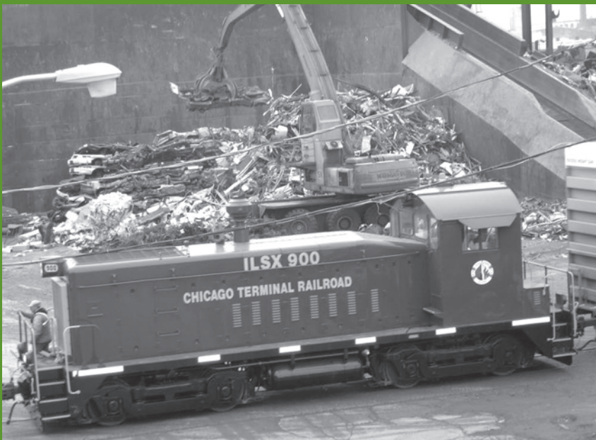
New LEED Council member, Chicago Terminal Railroad, brings competitive rail pricing and prospective new businesses to corridor.