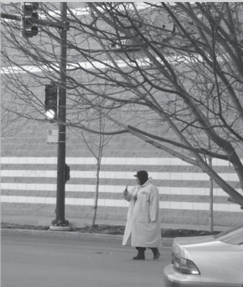
City's TMA directing traffic at new Marcey & Cortland traffic signal.

LEED Council remains dedicated to Advancing Economic Opportunities .