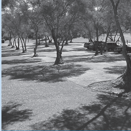
Future parking lots in Chicago can look like orchards and be "green" with trees and pervious concrete that filters stormwater.